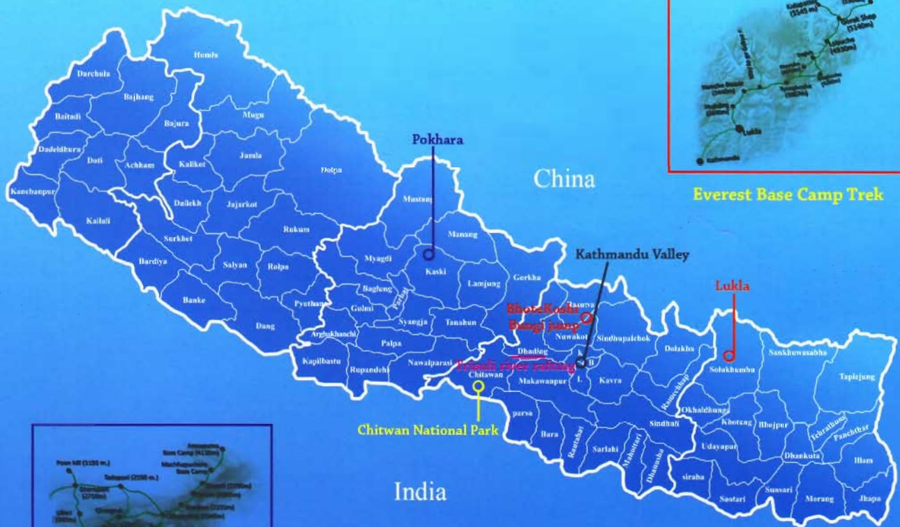
Everest Base Camp Trek