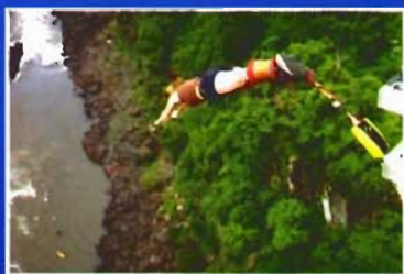
Bhote Koshi Bungi Jump