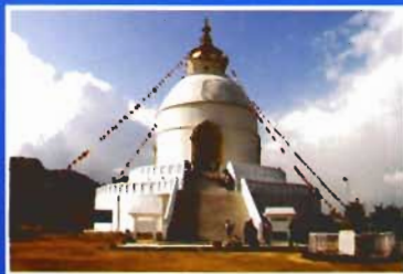
Pokhara Peace Stupa