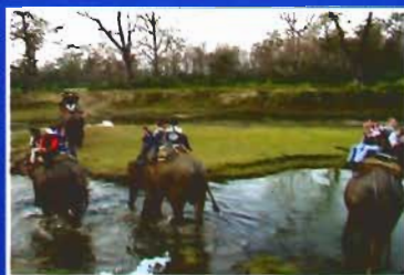
Chitwan Elephant Ride