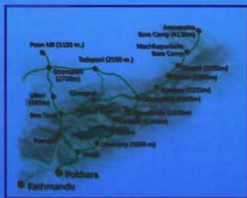
Annapurna Base Camp Trek